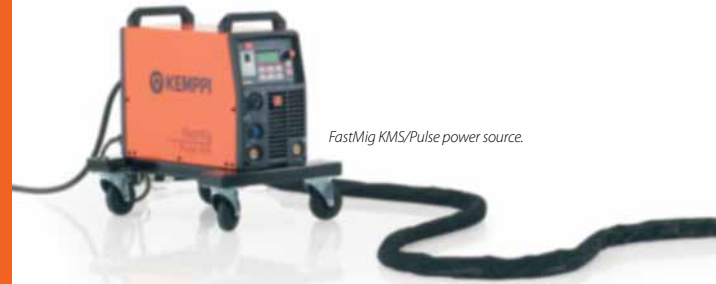
FastMig KMS/Pulse power source.