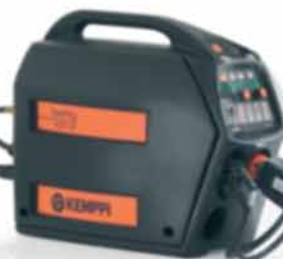
FastMig MXF 67 wire feed unit.

reddot design award honourable mention 2009